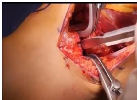
Opening at osteotomy