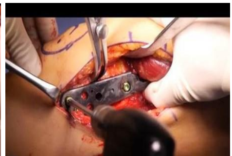
Fixation with distal femur locking plate