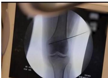
Localizing site of osteotomy

Non weight bearing mobilisation of knee joint started after 2 nd post op day, serial x rays taken monthly till union achieved.