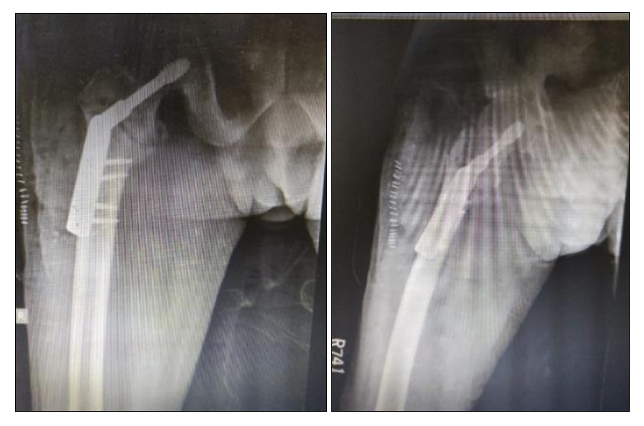
Post op X-rays