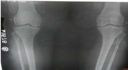
Fig 1: Pre operative ap x ray

In our study 95% patients had excellent results and 5% patients had good results. There were no complications developed intra operatively and post operatively. Limitations of this study were small population (40 patients) and short term follow up (6 months). In our study, we tried to evaluate the results of fixed bearing design in regarding of clinical, functional and radiological outcome of TKR at 6 months post operative interval. Evaluation of pain relief, range of movement and improved functions of all the patients were carried out, but implant durability and late complications were outside the scope of this study, because it requires the longer follow up. The present study shows that the total knee replacement is a safe option for primary osteoarthritis of knee joint in the elderly patients.