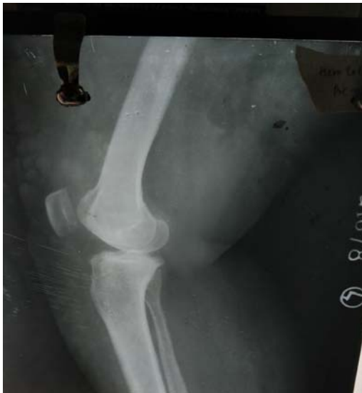
Fig 2: Pre-operative x rays