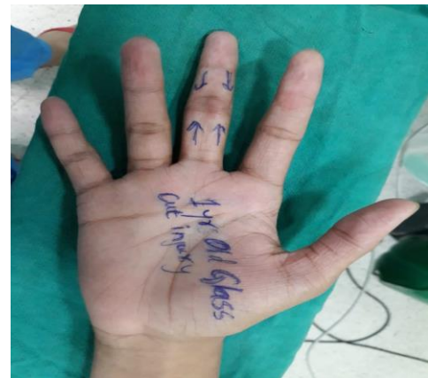
Unable To Flex Finger