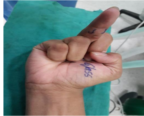
Preoperative Clinical Photograph

digits, flexion is to be increased a little in the more ulnar digits. After completing the flexor tendon repair, a dorsal splint is applied to keep the wrist in neutral position and metacarpophalangeal (MCP) joints in 50-70° of flexion. The proximal interphalangeal (PIP) and distal interphalangeal (DIP) joints should be able to extend fully. One week after surgery, patients are started on a controlled mobilization program (passive flexion, active extension). Active ROM exercise is started at 3 weeks and unprotected digital motion is allowed at 6 weeks.