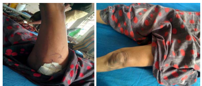
Fig 8: Flexion and Abduction on Post Op Day 3