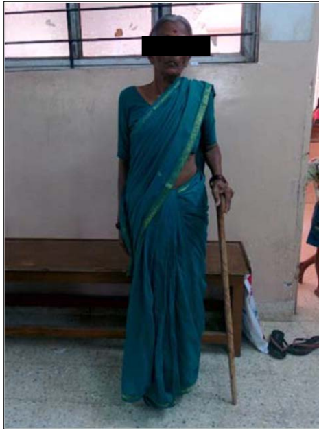
Fig 9: Follow Up At 6 Weeks