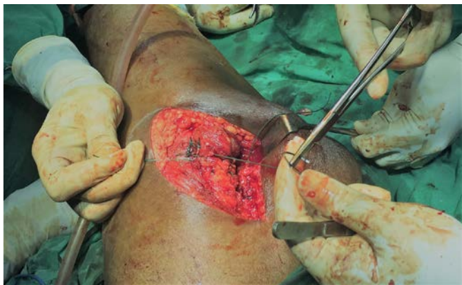
Fig 3: Greater Trochanter Reconstruction with Ethibond Sutures