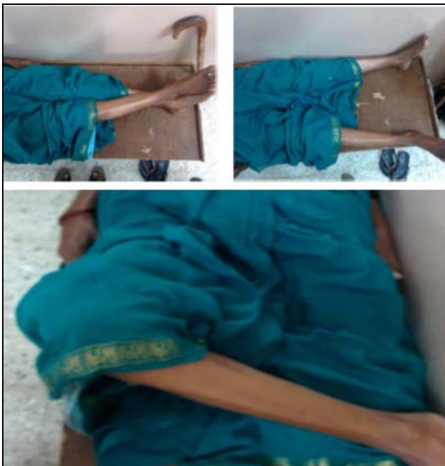
Fig 10: Movements at 6 Weeks of Follow Up