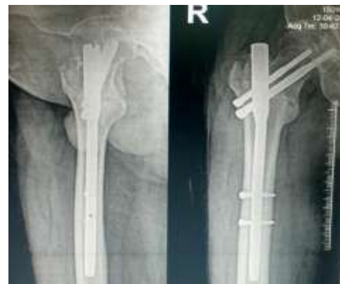
3 months follow up