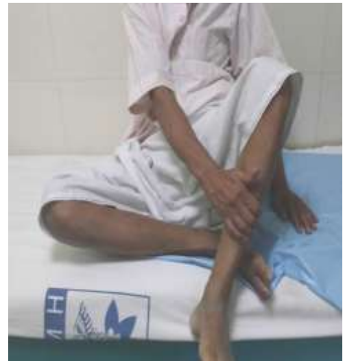
Sitting cross legged (restriction of abduction)