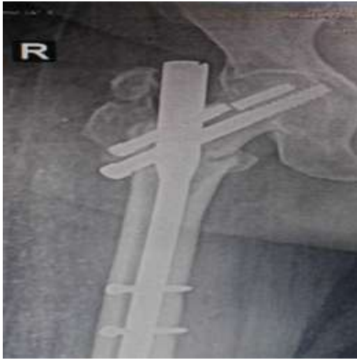
8 months followup with

Finally in our study Functional outcome was assessed using modified harris hip scoring at 6 months followup in PFN A2 group 4 patients (26.7%) had excellent outcome, 9 patients (60%) had good outcome and 2 patients (13.3%) had fair outcome and in PFN group 3 patients (18.8%) had excellent outcome, 6 patients (37.5%) had good outcome, 7 patients (43.7%) had poor outcome which was comparable to Ming Hui Li et al. [13] Our results are comparable to Sheng zhang et al. , [13] who had less mean operative time and less blood loss in PFN A2 group compared to intertan nail, and they conclude that patients in PFN A2 group had more lateral thigh pain, but in our study none of our patients had lateral thigh pain.