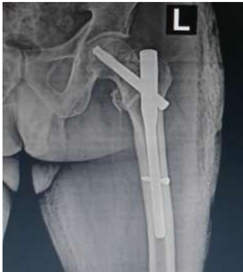
One month followup