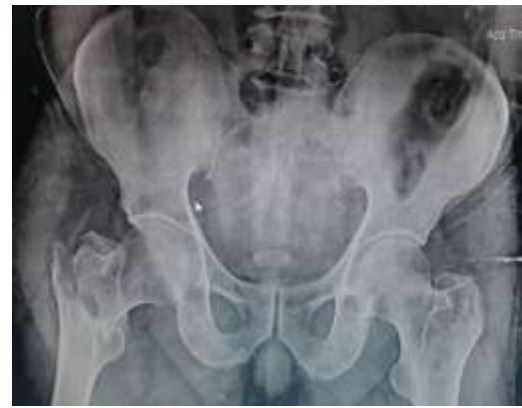
Pre op x-ray

Case 1: (Master chart reference no: 8) unstable fracture with singh's grade 3 and lateral wall thickness – 15mm.