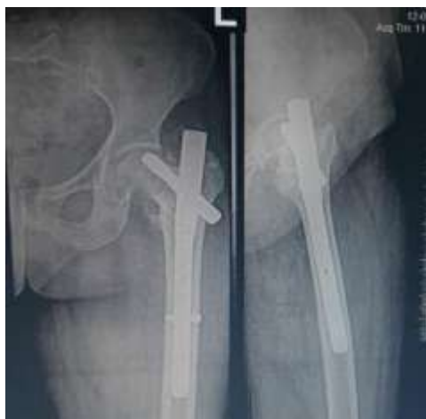
Screw cutout at 3months