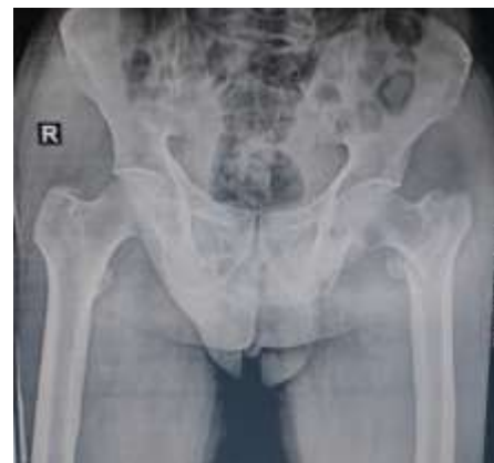
With traction and internal rotation