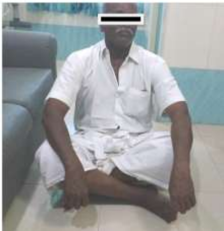
Sitting cross legged