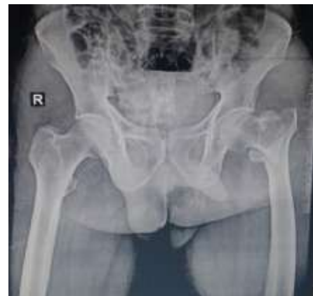
Pre-operative pic (Without traction)