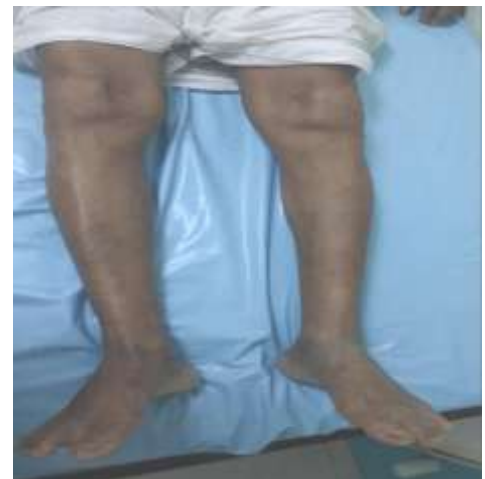
No limb length discrepancy