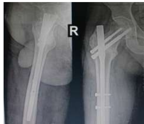
6 months follow up