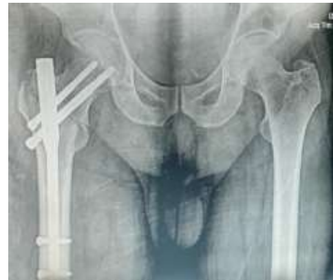
Immediate post op x-ray