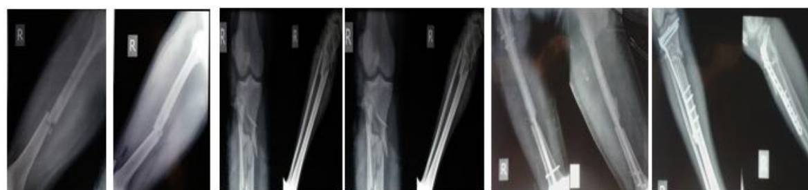
Pre op xray