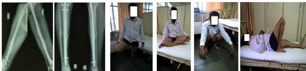
Follow up at 1 year