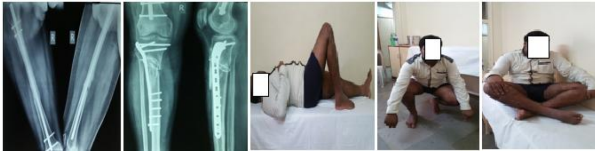
Xray at 9 months follow up