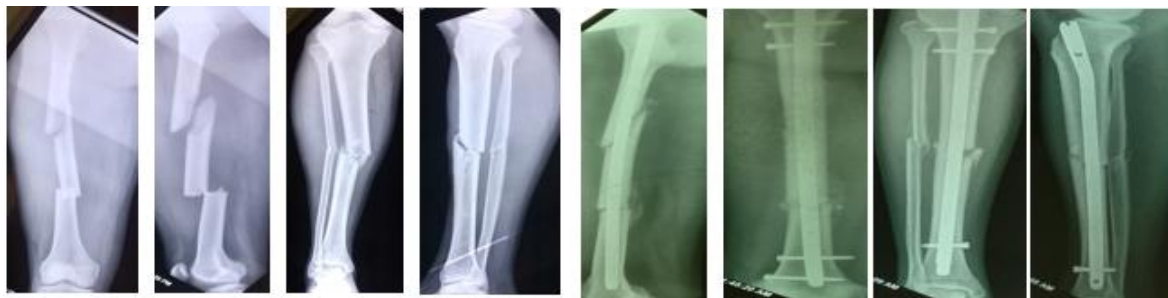
Pre op x-ray

In conclusion, floating knee injuries are a group of complex injuries that require a careful assessment to detect poor prognostic factors and associated injuries. Internal fixation of the fractures with thorough surgical planning and prolonged rehabilitation are recommended. A combination of these determines the ultimate outcome of these patients.