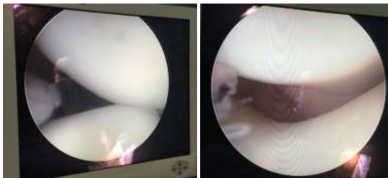
Fig 11, 12: Fixation of femoral end of graft under fluroscopic guidance