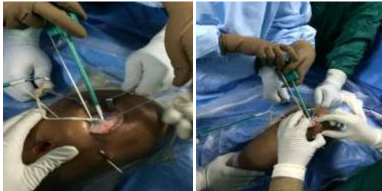
Fig 7, 8: Fixation of patellar end of graft