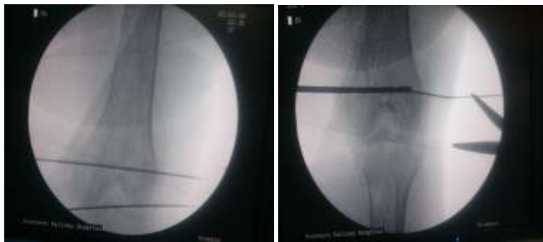
Fig 9, 10: Femoral tunnel preparation