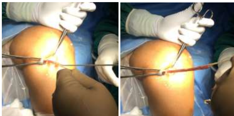
Fig 4(a, b): Double bundle anatomical graft preparation

As in post operative rehabilitation and followup, static quadriceps exercises and non-weight bearing walking with walker were started as soon as tolerated (at 3 weeks).At 6 weeks the brace was discarded and knee range of motion exercises and gradual weight bearing were started. The patient is being planned for allowed normal activities at 12 weeks. At the last follow up, which was 6 weeks post surgery, there was no pain, apprehension or lateral instability of the patella. The knee range of motion was 0-100 degrees. The radiograph showed no patellar subluxation and some osteopenia .The Kujala score was 72/100.