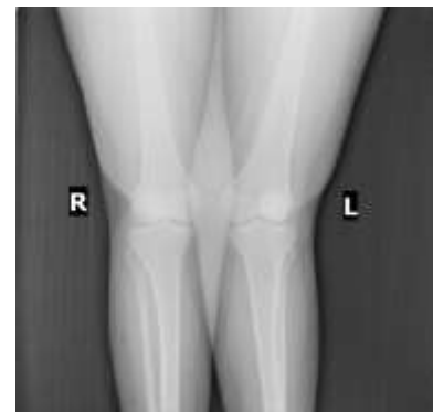
Fig 2a: AP radiograph of knee

Radiographs showed, no bony fragment in the medial patellofemoral joint, lateral patellar subluxation, Insall-Salvatti Index was 1.4 (Fig 2a, 2b). Magnetic resonance imaging (MRI) showed mild effusion of knee joint with complete tear in the MPFL at the patellar attachment, no osteochondral defect in the lateral patellar facet and no osteochondral fragment (fig 3). Of note, she had no other knee surgeries performed to the same knee.