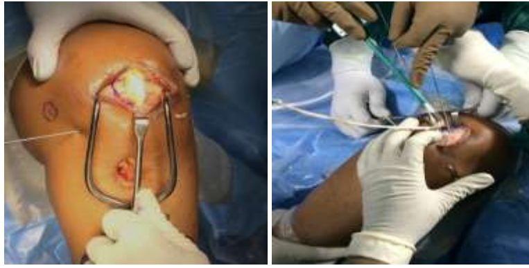
Fig 5, 6: Preperation of patella