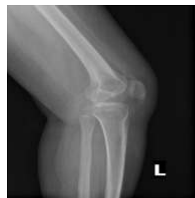
Fig 2b: Lateral radiograph of knee