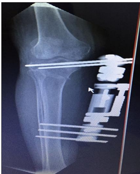
6 weeks post-operative