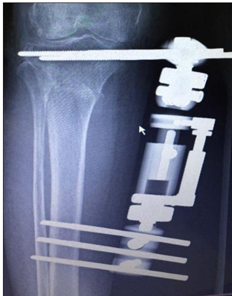
6 Months post-operative