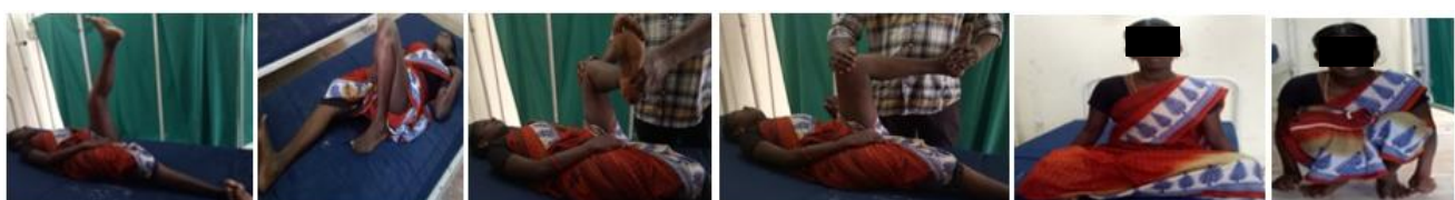
Extension Flexion Ex. Rotation Int. Rotation sitting cross legs squatting Range of Movements