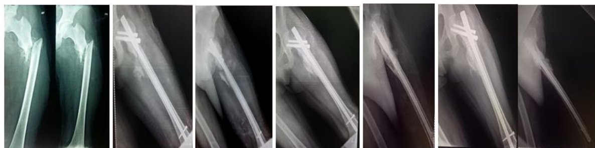
Pre Op Immediate Post Op 8 Months Follow-Up 1 ½ Year Follow-Up Follow Up X-Ray