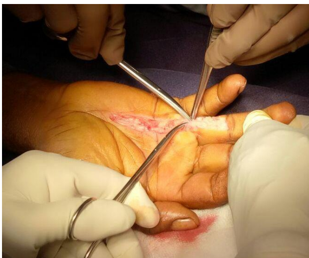
2. Incision and shortening of flexor tendon of ring finger