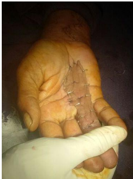
4: Split thickness skin grafting after tendon transfer