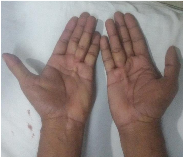
1: Clinical picture of patient with bilateral Dupuytren's contracture

the wound was done. Six weeks later slab was removed and rehabilitation continued with physiotherapy after which he was able to carry out his daily routine activities comfortably.