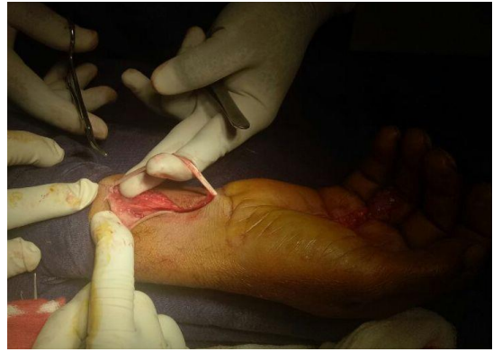
3. Palmaris longus tendon transfer and flexor tendon repair