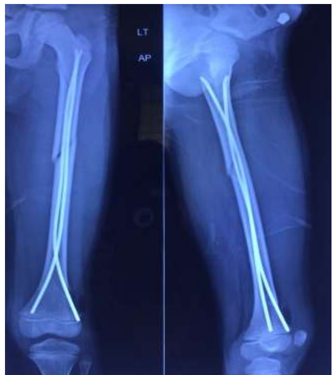
Fig 2: Immediate postoperative anterior posterior and lateral views showing good reduction