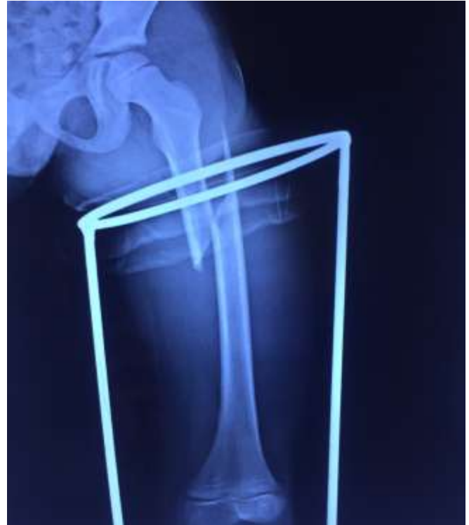
Fig 1: Preoperative radiograph showing long oblique spiral fracture of femoral fracture

to 8 weeks time with help crutches. The full weight bearing started at around 7 to 12 weeks of duration once we could see external callus on x-rays. In one case intraoperative perforation of cortex occurred. We noticed entry site inflammatory changes in three cases. In one case reintroduction of nail was done under local anesthesia. We do not have any cases of deep infection, delayed union and, non-union in our series. We have done all the cases in closed technique except in 2 cases we have to open the fracture site. There was soft tissue interposition in those two cases [2] .