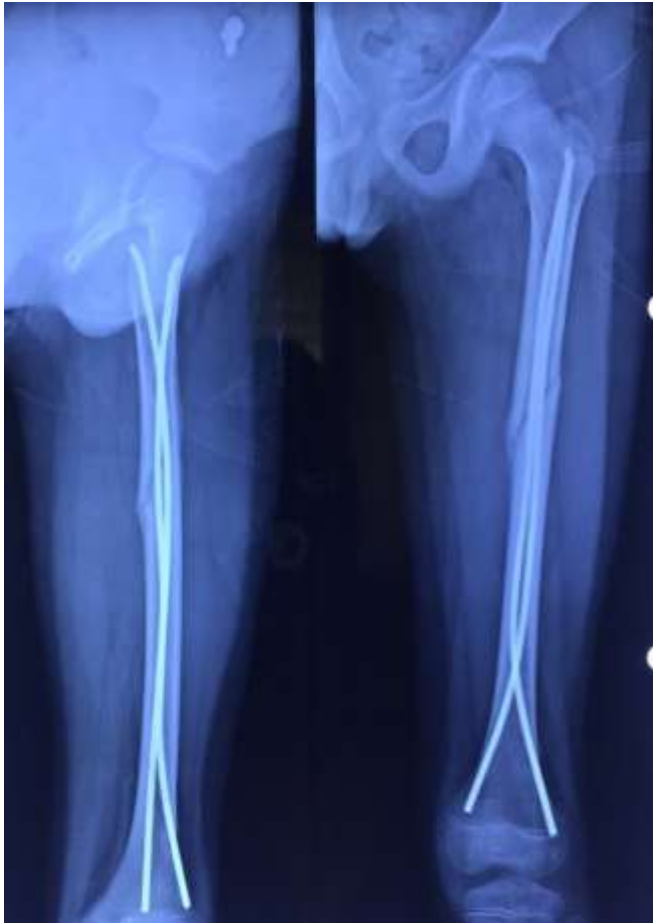
Fig 3: Follow up x-ray after six weeks showing good alignment and union signs