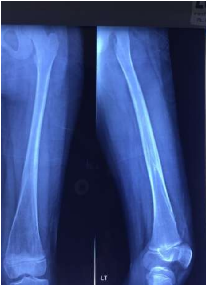
Fig 5: Xray showing good consolidation after the nail removal.

Titanium elastic nails have more advantages over the other modalities. It has got both stability and elastic mobility. The stability is mainly by the nail itself and bone & surrounding tissues. The nail provides internal elastic support. The bone provides axial stability if there is no overlap of the fragments. This is by end to end contact of the cortices. The soft tissue plays very important role. The muscles serve as guy-ropes which help in spontaneous postoperative correction of angulation deformity [3]. ESIN allows certain amount of movement at the fracture site which encourages external callus formation by reducing shear forces and converting it into compression forces [9]. One more advantage is as its closed procedure, there is no muscle & periosteal damage with intact fracture hematoma. As it is simple procedure, It allows early weight bearing. It is also load sharing device with internal splitage.it does not violate the epiphysis. There is no risk of infection with this technique as it is closed procedure. There is less damage to the periosteum. It also preserves fracture hematoma. Ligier et al [5] treated 123 femoral diaphysis fractures with ESIN. All fractures united out of it only 13 patients developed entry site irritation.