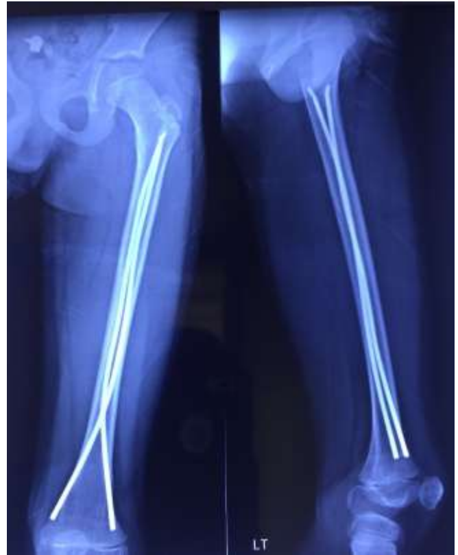
Fig 5: Follow up x-ray one year and four months duration showing good union and excellent functional results

Two cases were very comminuted and we noticed shortening of 0.5 to 1 cm in that cases. We have advised delayed weight bearing in that cases to avoid further collapse. There was no limb lengthening in our series. We could achieve 0 to 130 degrees of knee motion in almost 85 % of cases. In three cases there was limitation of knee flexion in last 20 degrees. In that cases we found nail site inflammatory changes and also nails were cut too long. In these cases the limitation were improved only after the nail removal was done. We do not have any physeal injury, growth plate arrest, osteomyelitis in our series. Also we do not have any cases of varus and valgus angulation, rotational malalignment in our series. Uptill now we have removed nails in ten cases. we usually remove the nail after one year of the procedure. We have not found any refractures after the nail removal in our series Theoretically it is possible to remove the nail after 3 months but there are always chances of refractures with early removal of nail. Our mean follow-up was one and half years [4] .