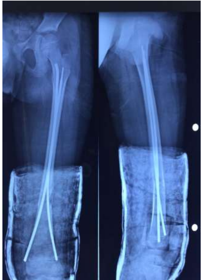
Fig 3: Two months follow – up x-ray with signs of union