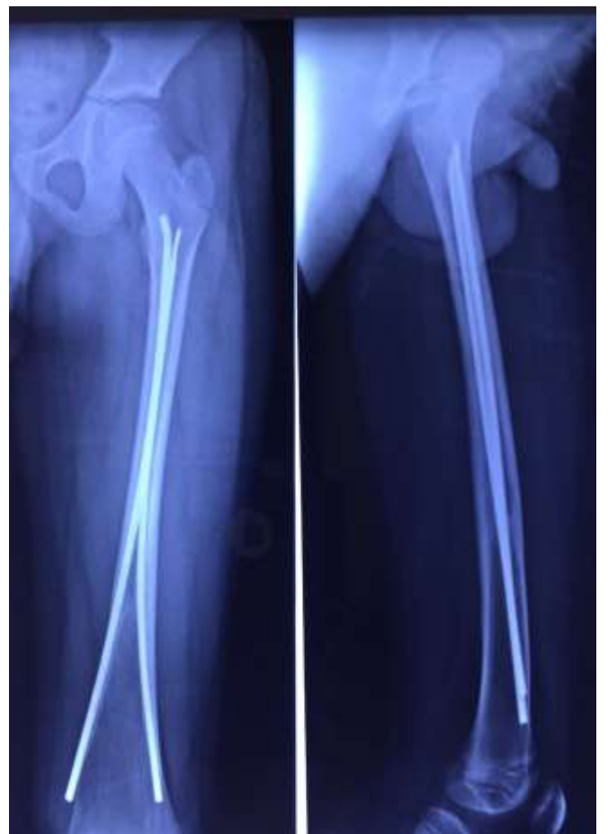
Fig 4: Two years follow up x-ray with united fracture