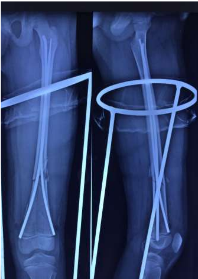
Fig 2: Immediate Post Op X-ray showing medial & Lat ESIN in situ with post op immobilisation with Thomas splint