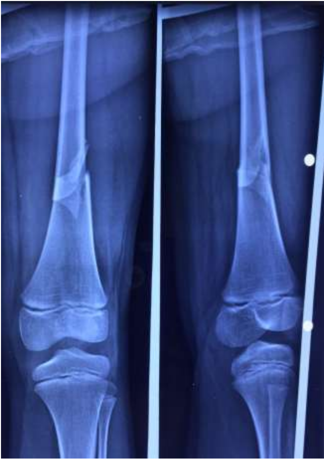
Fig 1: Preop X-ray showing Distal end Femur AP & lat view