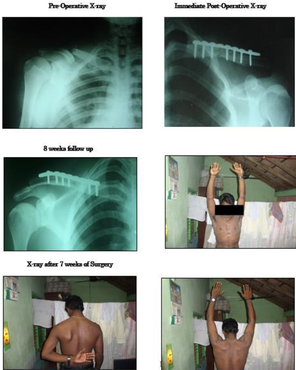
Fig 3: Case – I