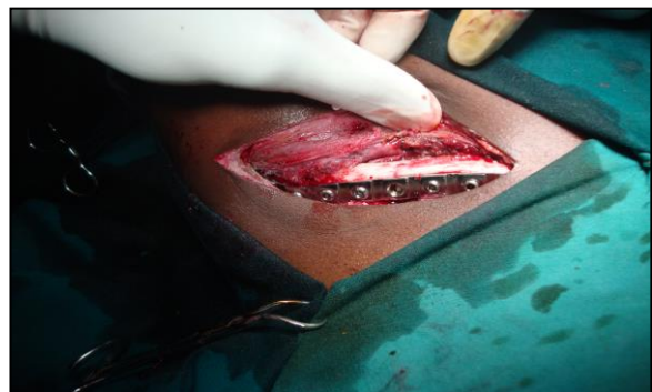
Fig 2: Plate fixation