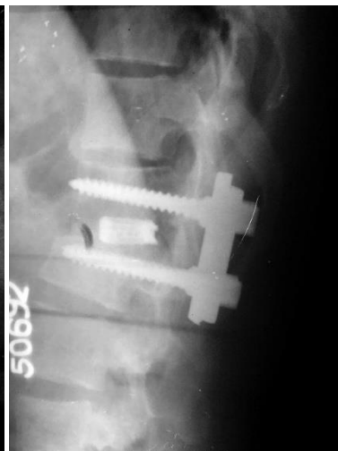
Post Op Ap View