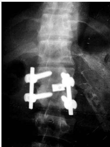
Post Op Ap View