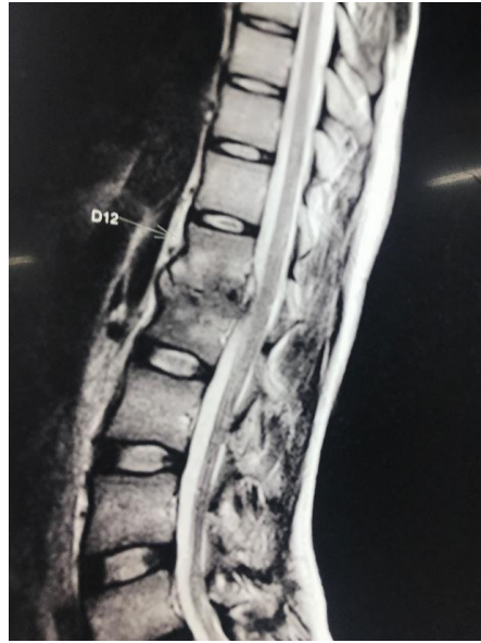
MRI Scan Sagittal Section