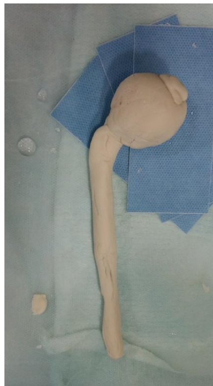
Fig 1: Handmade spacer

The two stage protocol was used. All the operations were done through same incision as index procedure. The first stage consisted of component removal, irrigation and debridement and implantation of handmade articulating antibiotic impregnated cement spacer. The type of antibiotic used in the spacer was determined by preoperative hip joint aspirate culture. We used combination of vancomycin 4 gm and gentamycin 2 gm per 40 gm cement. For handmade spacer we used 4.5 mm Steinman pin with antibiotic cement mould. The core part of femoral head was formed and placed at the tip of Steinman pin based on the size of acetabulum. The cement is wrapped over the stem part so that it should not become too thick, the neck part should be thicker to prevent fractures. Intravenous antibiotics were given postoperatively for 2 weeks based on culture sensitivity followed by 4 weeks of oral therapy. The patients were allowed non weight bearing walking with walker/crutches. ESR and CRP were checked every 15 days. The decision to proceed with implantation was determined by clinical evaluation, resolution of blood markers (ESR and CRP) and negative hip joint aspirate. The second stage of revision includes spacer removal, tissue sampling, irrigation and debridement and reimplantation. After the second stage, patients were treated with prophylactic antibiotic for 15 days. All the patients were followed up for a minimum of 2 years after implantation.