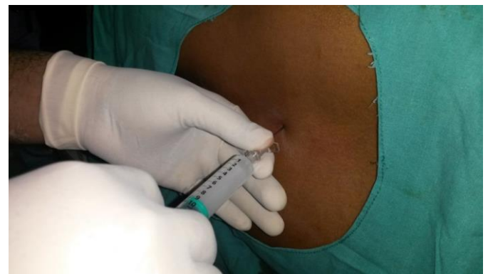
Fig 1: Administering epidural steroid

Epidural steroid injection was carried out in the operation theatre. Patient was positioned in lateral position. Injection containing Triamcinolone 40mg mixed with 3 to 4 ml of 2% lignocaine was injected to the epidural space without fluoroscopic guidance by interlaminar approach. All these injections were performed at one level cephalad to the disc herniation.