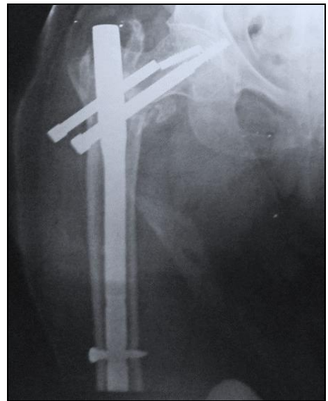
Fig 7: PFN with broken screw and screw cut out