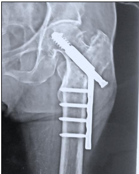
Fig 4: DHS with screw back out