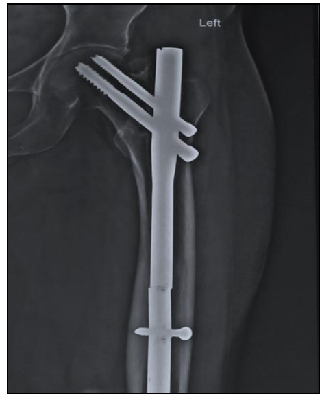
Fig 8: PFN with Breakage of implant