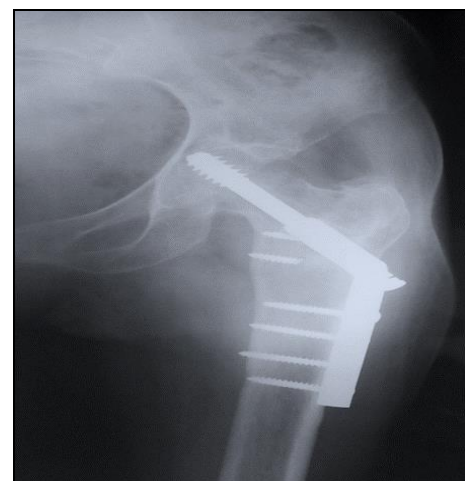
Fig 2: DHS with screw cut out