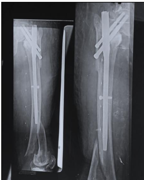
Fig 5: PFN with shortening, varus collapse and peri-implant fracture