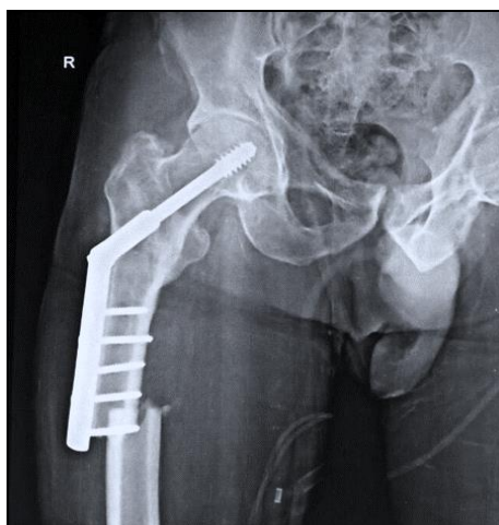
Fig 1: DHS with peri-implant fracture