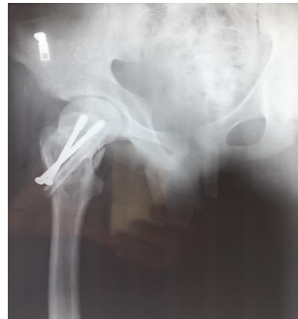
3 months follow up