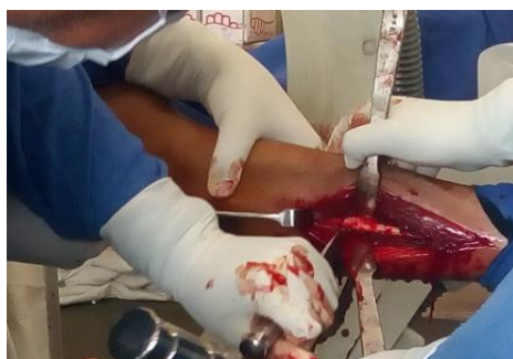
DFibular cortical graft

Postoperative AP, Lateral radiographs are taken. Intravenous antibiotic cover given for 3-4 days. Patients were discharged after 5 days. Sutures were removed after 2 weeks .Weight bearing not allowed postoperatively .We followed the patients 6 weekly upto 3 months then 3 monthly thereafter with clinical as well as radiological recovery. Serial x rays are taken in every follow up visit and records are maintained. Toe touch weight bearing with help of walker or crutches allowed after 6 weeks and if patient is comfortable to complete weight bearing allowed around 3 months