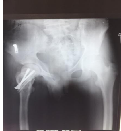
6 Weeks follow up