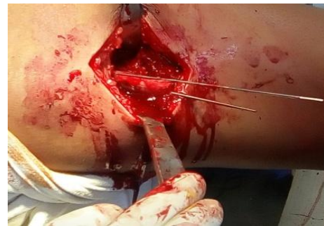
Fibula was inserted over guide wire