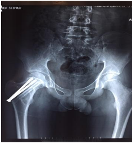
9 months follow up