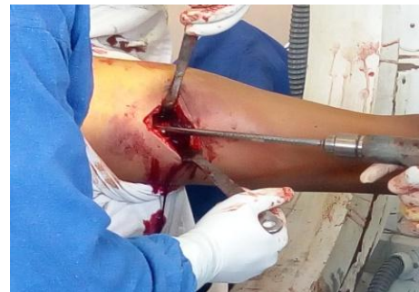
Reaming with 8 mm reamer