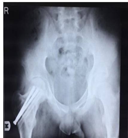
6 months follow up