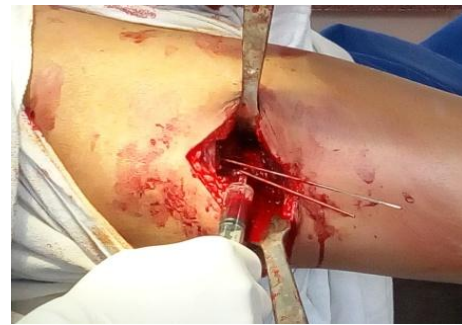
DHS guide wire placed

Lateral incision is placed over mid of greater trochanter to extend distally. Soft tissue is dissected, vastus lateralis is elevated to expose lateral cortex of femur. A DHS guide wire is placed in centre of the neck in both AP and Lateral views under fluoroscopy. Cortical window is created with the help of drilling the cortex with 8 mm reamer over guidewire that opens into lesion and decompresses the cavity. Window created is large enough that allows complete curettage of the lesion .The material obtained from lesion examined grossly and send for histopathology. Curettage of lesion is done with a curettage spoon. The harvested fibula is then sized accordingly to get fit into the defect snugly. Fibular graft is gently hammered into the defect over centrally placed guidewire through the cortical window supplemented by two 6.5 mm cannulated cancellous screws without crossing capital physis.