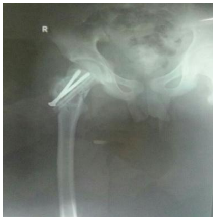
Post-operative x ray