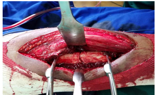
Fig 2: Exposure and reduction of the fracture site

The fascia lata was exposed and incised in the direction of these fibers. The vastus lateralis was retracted forward while making the progressive haemostasis of the perforating arteries of the femur up to the fracture site. The bone ends were revived, the fracture was reduced and maintained by a reduction forceps (Figure 2).