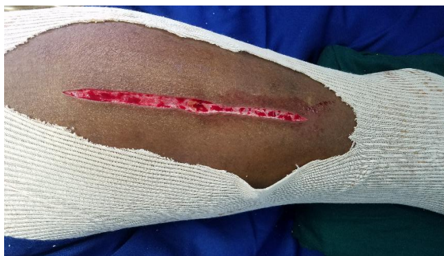
Fig 1: Posterolateral approach

The operative technique was identical for all our patients. The Patient was placed in lateral decubitus under locoregional or general anesthesia. After debridement, a posterolateral approach centered on the line from the greater trochanter to the lateral condyle was made and followed by the haemostasis of the subcutaneous cellular tissue. (figure 1)