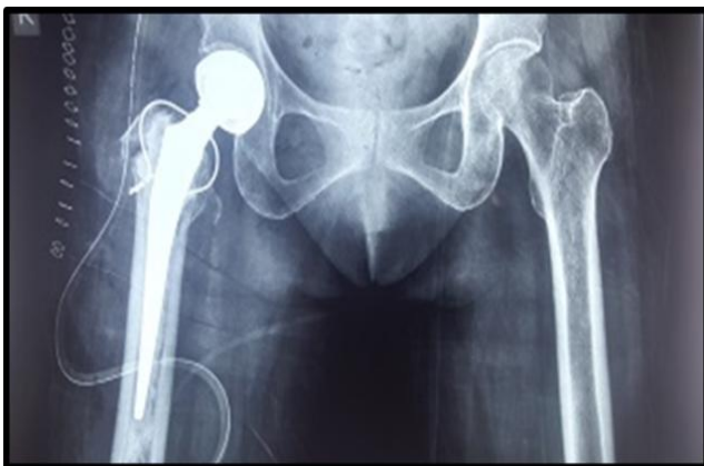
Image 4: After Bipolar hemiarthroplasty