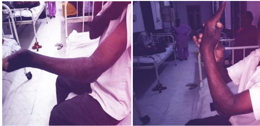
Fig1c: postoperative range of movements