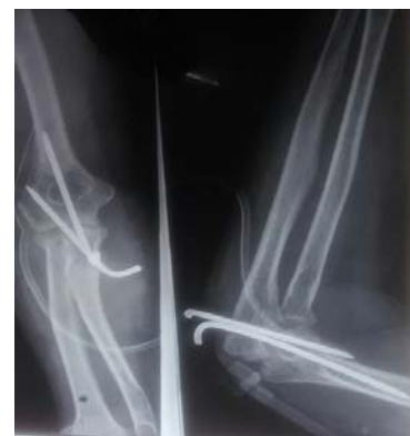
Fig 1b: postoperative x ray with k wires