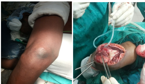
Fig 2c: Speed technique of V-Y plasty