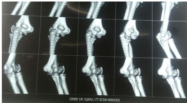
Fig 2b: 3D CT elbow