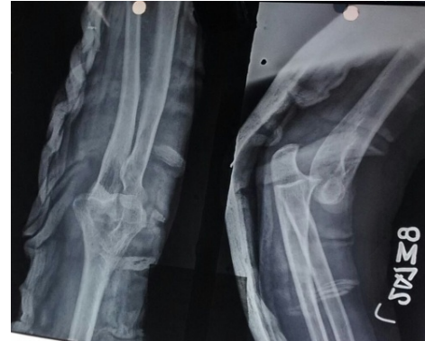
Fig 3a: preoperative x ray of 4 months old dislocation