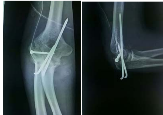
Fig 2d: postoperative x ray with cc screw and k wires