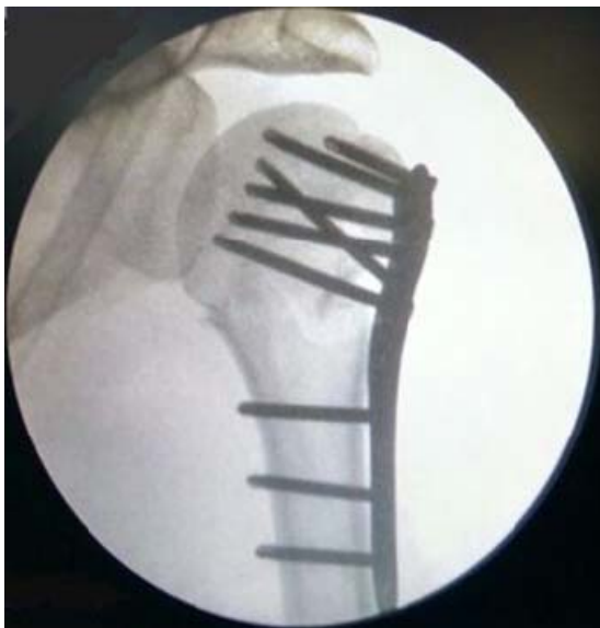
Fig 2: Post-op X-ray: Ideal positioning of the PHILOS plate