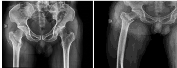
Preoperative case 1(DHS)