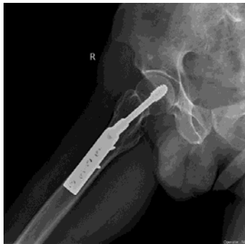
Postoperative 1 year