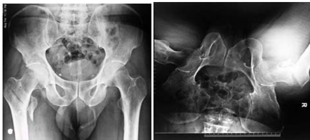
Preoperative case2 (PFN)