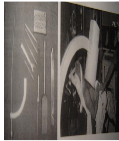
Fig 1: Image intensifier

Dash score gradually improved in 24 weeks follow up but 5 patients had stiffness of shoulder joint, most probably due to injury to rotator cuff [Fig:5a, b]. Radiologically, four cortices union was only 50% in 24 weeks post operative time. Union was delayed due to distraction at the fracture site during nail insertion. There was implant failure in 1 patient [Fig: 4].