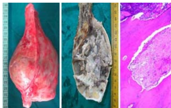
Fig 4: Gross appearance of the tumour, cut section and histopathology