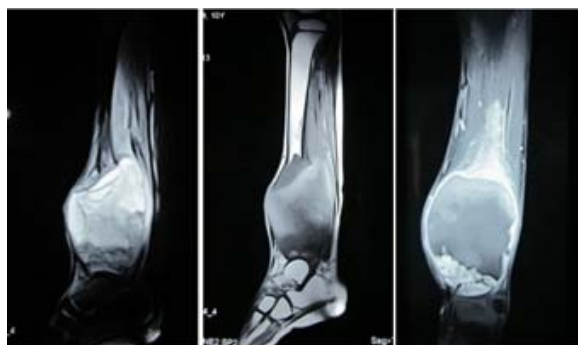
Fig 3: T1WI and T2WI MRI axial section showing mixed heterogenous with fluid filled spaces cystic composition of lesion, Hyperintensity caused by cystic lesion is better appreciated on T2WI.