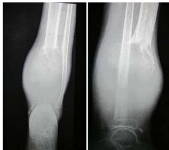
Fig. 2: Radiograph of the left both bone leg with ankle AP and Lateral view showing expansive lytic lesion in metaphysis-diaphyseal region, periosteal reaction and cortical breach with soft tissue involvement