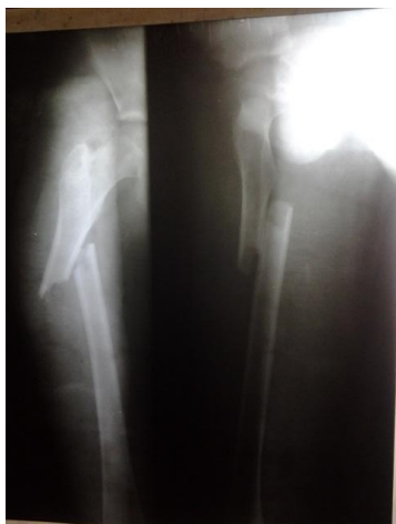
Fig 1: Flynn criteria 10: excellent result (example 1)