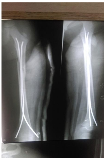
Fig 2: Flynn criteria 10: excellent result (example 2)