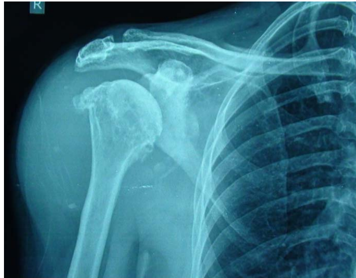
Fig 2: X-ray right shoulder; increased soft tissue shadow with degenerative changes in humeral head and glenoid with reduced joint space and diffuse osteophytes.

strength in left upper limb and bilateral distal extremities was 5/5. There was reduced sensation of the entire right upper extremity and healed trophic ulcers were seen on the fingers and the dorsal and ulnar border of the forearm and hand (Fig 1). There was wasting of the thenar, hypothenar and Interossei muscles. The triceps, biceps and brachioradialis reflex were absent.