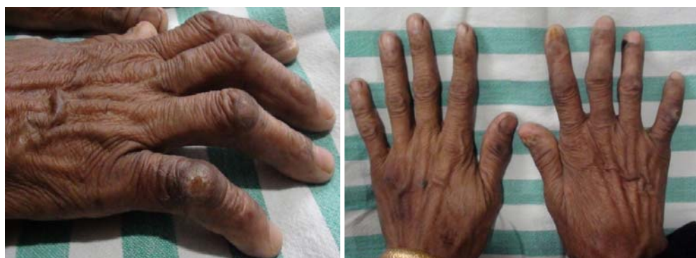
Fig 1: Right hand showing healed trophic ulcers, clawing and wasting of Interosseus

A 62 year old female presented with painless swelling of her right shoulder with restricted active movements. Her condition began as reduced sensation in her right upper limb when she was approximately 35 years old. No medical treatment was taken other than some indigenous treatment in the form of some oil for local application and her condition gradually worsened. There was no history of any significant illness in the childhood or trauma in the past.