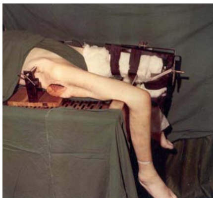
Fig 1: Device used to test stability of the hip joint showing pelvis fixed and protectors to measure the angle of flexion/extension, adduction/abduction and internal/external rotations

A series of cadaveric tests were conducted on cadavers to determine the superiority of this Modification over the conventional Southern, Posterior Approach as described by Austin Moore in 1957.