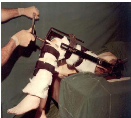
Fig 3: Internal rotation torque being applied when the hip joint was standardized to a fixed angle of flexion and adduction

The stability of the Hip Joint was tested as seen above by applying torque with the Hip Joint standardized to fixed angle of flexion and adduction, to mainly see whether the trochanteric fixation disrupted or the Hip Joint dislocated.in all