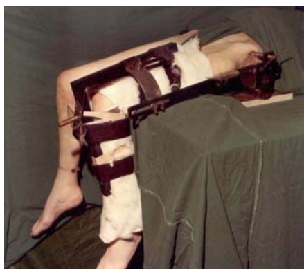
Fig 2: Device used to test stability of the hip joint showing pelvis fixed and protectors to measure the angle of flexion/extension, adduction/abduction and internal/external rotations

Correspondence K Mohan Iyer Senior Consultant Orthopaedic Surgeon, Bangalore, India.