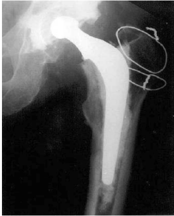
Fig 10: Radiograph of Total Hip Prosthesis.

The Modified Posterior Approach follows the anatomical intermuscular plan and permits full exposure of both the proximal femur and the acetabulum. (Refs.No.1,2,3 &4) Iyer, Shatwell and Elloy reported on early results in 44 patients who had a hemiarthroplasty done with no dislocation in this series. (Ref.No.5)