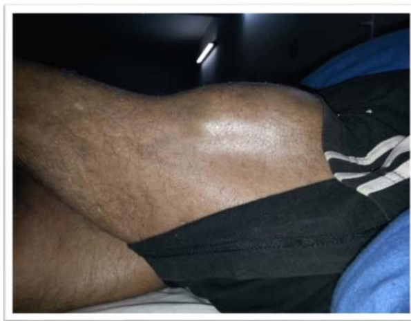
Fig 3: Pseudotumor of left thigh.

L) Thigh: Swelling on anterior aspect, 15x7x5cm, Bluish, Itchy, Firm, Non-Tender, Non-Pulsatile swelling with normal surface temperature and no Sinus, Scars or Discharge.