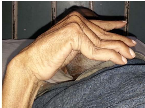
Fig 1: Swan neck deformity.

FINGERS showed bilateral Dynamic Swan Neck Deformity, right side more than left side. The deformity was correctable and the finger joints were supple.