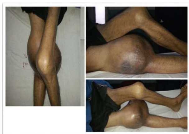
Fig 2: Pseudotumor of right knee.

R) Knee: 30x28x15cm, Hyperpigmented, doughy firm, very Tender, Non-Pulsatile swelling with normal surface Temperature and no Sinus, Scars or Discharge were seen.