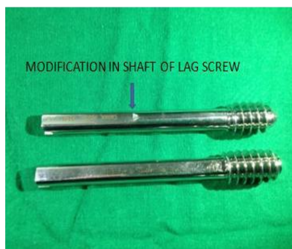
Modified lag screw versus Normal lag screw

In this study, we have used modified dynamic hip screw to limit the over collapse which is undesired in unstable intertrochanteric fractures. In this implant we have done modification in the shaft of lag screw, we have reduced the length of keyed screw system, so that we can have a maximum of 1 cm collapse, hence there will be limitation in collapse unlike the original implant.