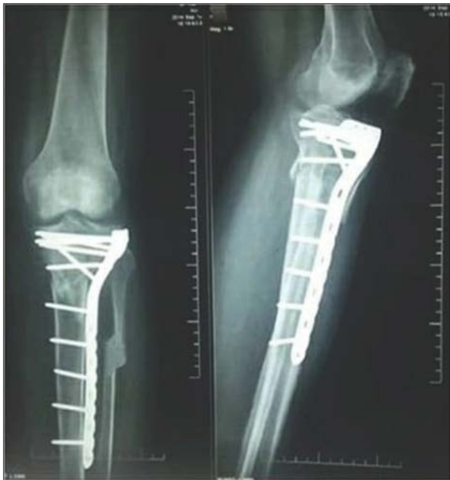
Fig 9: 6 months follow up