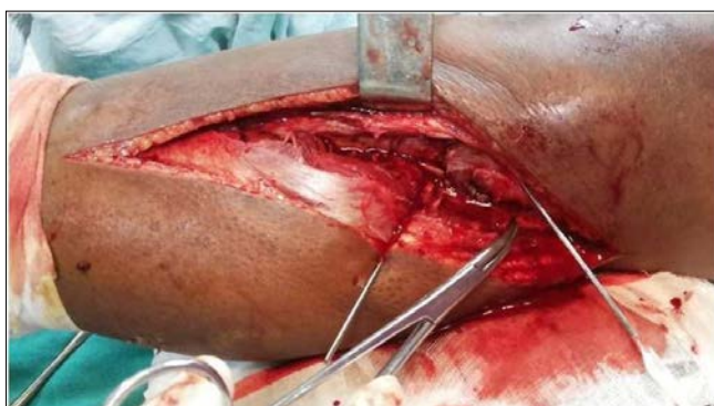
Fig 4: Intraoperative image