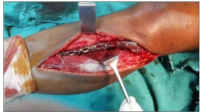
Fig 5: LCP in position