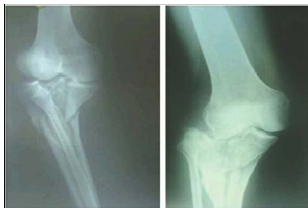
Fig 7: Pre-Operative