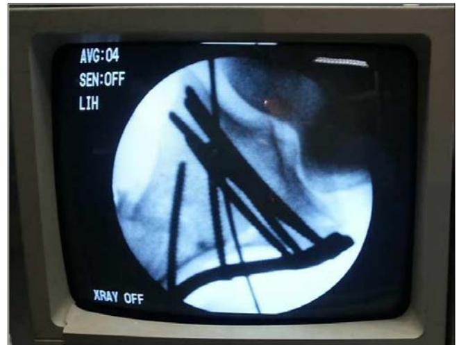
Fig 6: Radiographic image