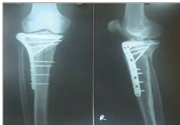
Fig 8: Immediate Post-Op