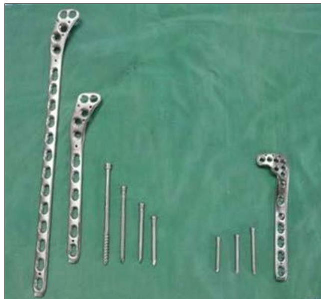
Fig 1: Locking compression plate for proximal tibia

Cortical screws have a thick core with narrow thread and are used for purchase in cortical bone. Cancellous screws have a thin core with wide and deep threads and used for purchase in epiphyseal and metaphyseal areas of bone. Full threaded screws acts as fastening device for the plate. Partially threaded screws are used as lag screws to achieve compression of fractured articular surface.