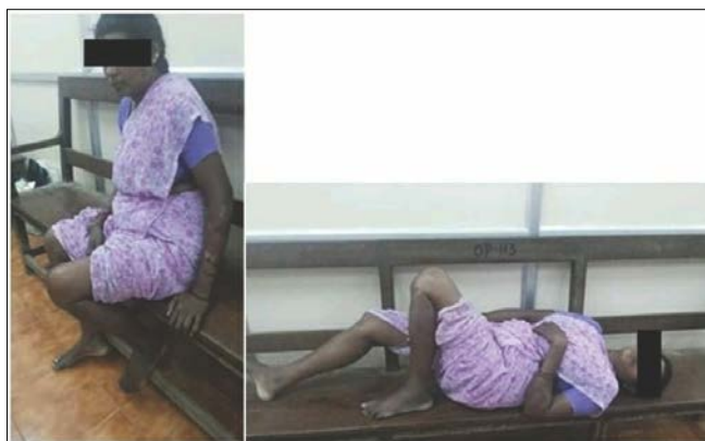
Fig 10: Clinical pictures in post op review