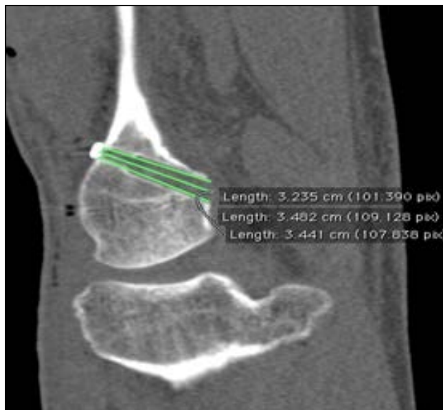
Fig 3: To measure the femoral tunnel length, we selected the plane in which the entire length of the femoral tunnel showed the maximal width. Then we drew the lines along the margins of the AM and PL tunnel as the shortest and the longest length connecting the outer and the inner aperture on the sections. The average of these two measurements corresponds with the central tunnel length measured by drawing a line along the centre of the tunnel connecting the outer and inner apertures