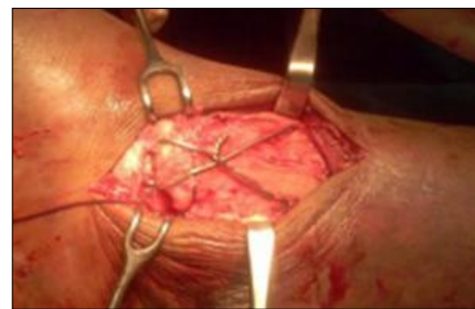
Image 1: Clinical photograph intraoperative

We were carefully inspected the interior of the joint, particularly at the superomedial corner, to make sure that Kirschner wires or the screw had not crossed the articular surfaces., we made roentgenograms to verify the position of the screw or the Kirschner wires and any faulty insertion could be avoided as shown in image 2. Hook or cotton test [17] performed to assess syndesmotic injury. At the end of operation, we deflated the tourniquet, obtained haemostasis, and closed the wound with interrupted suture. We avoided tight stitches to prevent necrosis of the skin edges. We applied thick padding and a posterior plaster splint with the ankle in neutral position.