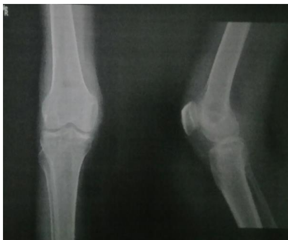
Fig 2: Pre procedure X-Ray