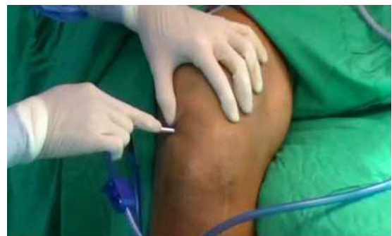
Fig 1: Arthroscopic Knee Lavage being Performed.

patellar area with one hand and releasing the thumb block of arthroscopic cannula at the same time. This filling and emptying of the joint was repeated till 3000 ml of ringer lactate is used. Now injection Methyl prednisolone 80 mg was mixed with 5 ml 2% of lignocaine and spinal needle was attached to the syringe. Through proximal main opening of the cannula, the needle was pushed inside and material injected into joint with the side lock closed. Immediately the cannula was withdrawn and knee joint is flexed few times for good distribution of drug into the joint. Antiseptic dressing and crepe bandage was given and patient walked out of operation theatre. Apart from this procedure, medications in the form of antispasmodics, painkillers and calcium supplementation was given to the patient. This procedure was followed by Physiotherapy to the patient for static quads, static hamstrings, ankle toe movements and knee range of motion.