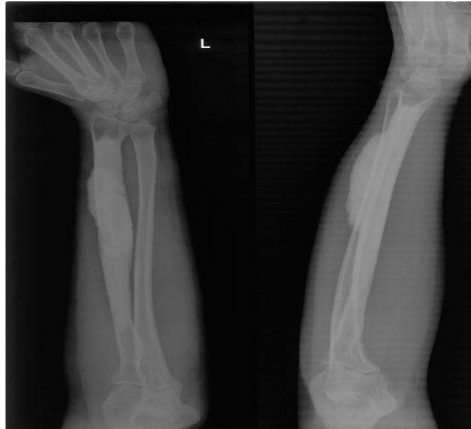
Fig 1: X- ray left forearm AP and Lateral showing hyperostosis left radius cortex with obliteration of medullary canal and candle wax appearance of cortex.

pathology report described nonspecific, dense cortical bone with mature and immature bone tissues. Single infusion of 5 mg zoledronic acid over 30 minute and analgesics were given to the patient. Physiotherapy started to prevent the deformity. After 3 months in follow up, the patient reported alleviation of the pain.