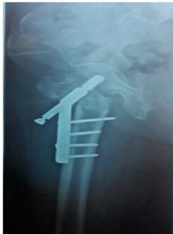
B. 3 months followup