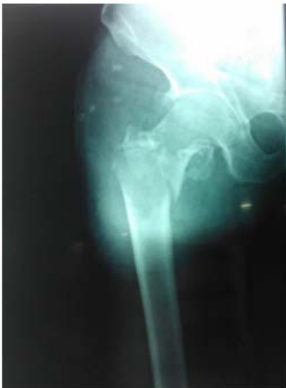
A. Preoperative view

A comparison of intra-operative, early and late complication rates revealed no statistically significant differences between study groups ( P = 0.324 for intra-operative complications, P = 0.223 for early complications, and P = 0.357 for late complications). A comparison of time to union demonstrated no statistically significant differences between study groups ( P = 0.542 ). The outcome of stable fractures treated with either DHS or PFN were similar, unstable inter-trochanteric fractures treated with PFN has significantly better outcomes with all having good results. Out of 30 A3 fractures in group 1, reduction loss occurred in 12 hips and in group 2 it is 2. In unstable fractures reduction loss is significantly lower in group 2 than group 1 ( p < 0.005 ). Total duration of surgery was significantly lower in group 2 than it was in group 1 ( p < 0.005 ) (Graph.2)