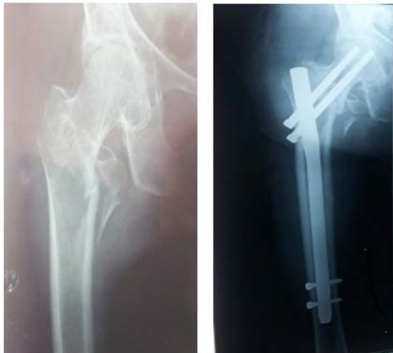
Fig 3: PFN FIXATION SHOWING PRE-OP X-RAY AND IMMEDIATE POST-OP X-RAY

Followup showing screw penetration into acetabulum (because of complete weight bearing walking against doctors advice)